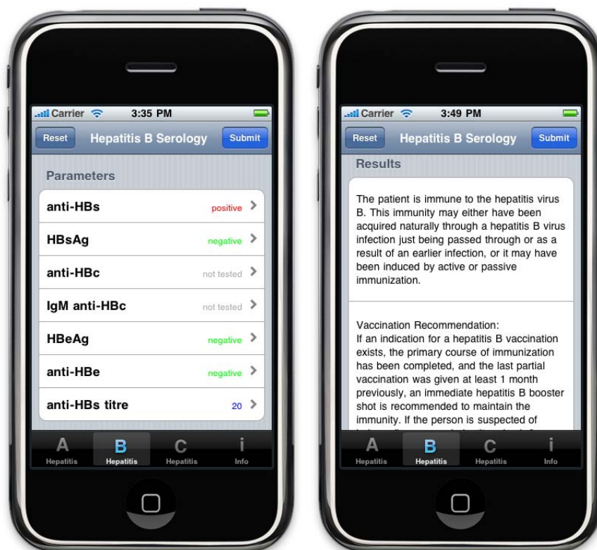
Figure 3: Input and Interpretive result on the iPhone client